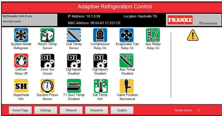
Sample screen of system performance accessed remotely.